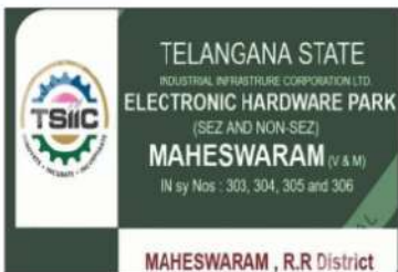
Electronic Hardware Park