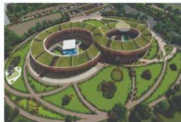
World Biggest Pharma City (20,000 Acres)