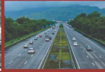
Srisailam High way