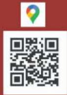
Scan this QR code to view the site Google Coordinates