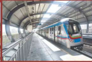
Extenof Metro Rail Corridor from Mind Space to Airport