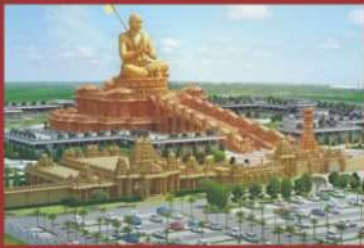
Statue of Equality (216 feet)