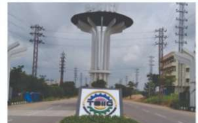
E-CITY (Fab City)